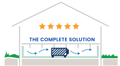
ENCAPSULATION WITH APRILAIRE DEHUMIDIFICATION