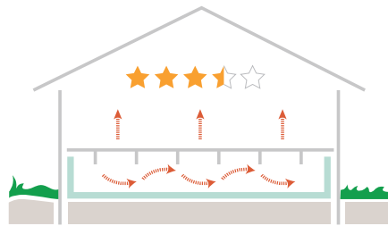
YOUR CRAWL SPACE ENCAPSULATED